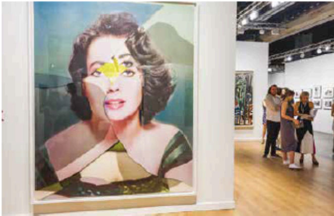
1. The scene at Art Basel Miami Beach.

FASHION & YACHTING LIFESTYLE | MODA Y ESTILO DE VIDA NÁUTICO