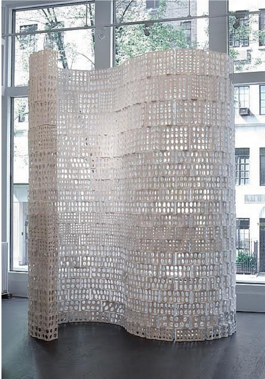
KRISTINA RISKA (Finnish, b.1960) Silence of Light , 2015 Stoneware sculpture, aluminum oxide slip 89" H x 84" W

35 East 10th Street | New York NY 10003 | 212 343 0471 | info@hostlerburrows.com 6819 Melrose Avenue | Los Angeles CA 90038 | 323 591 0182 | la@hostlerburrows.com