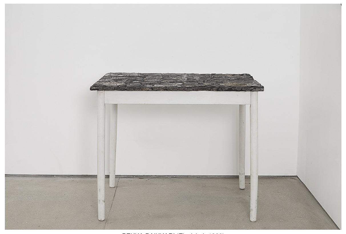
PEKKA PAIKKARI (Finnish, b.1960) Table (Recycled Readymade) ceramic, wood 28" H x 35" W x 24" D