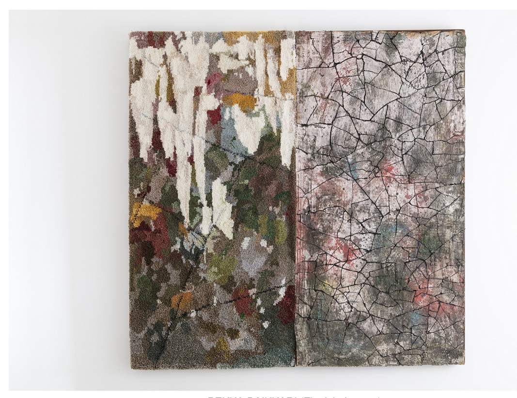
PEKKA PAIKKARI (Finnish, b.1960) Change, 2019 ceramic, linen, wool, cotton, wood 78.7 x 78.7 inches; 200 x 200 cm