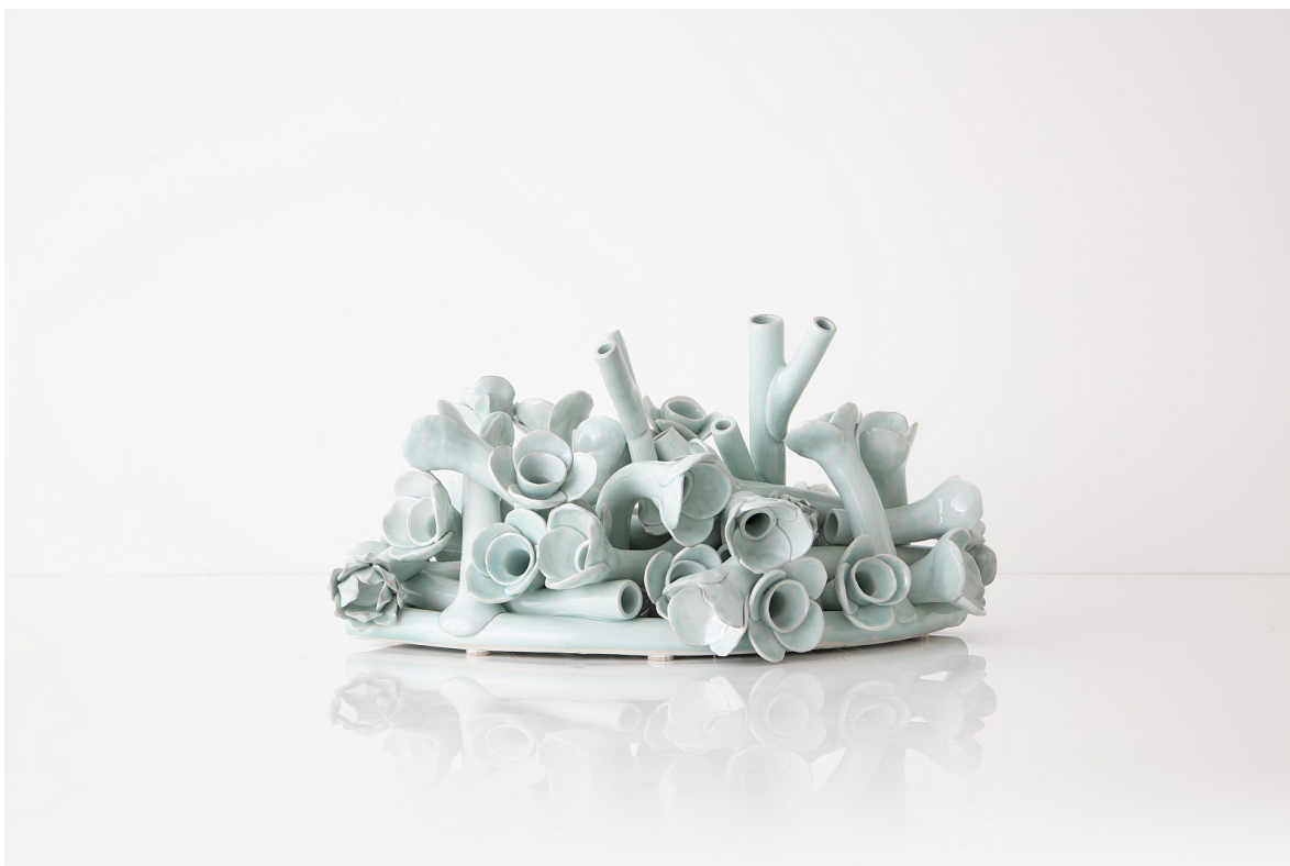
ANAT SHIFTAN (Israeli-American, b.1955) Flora with Twigs in Celadon , 2020 Porcelain 12" H x 23" W x 15" D