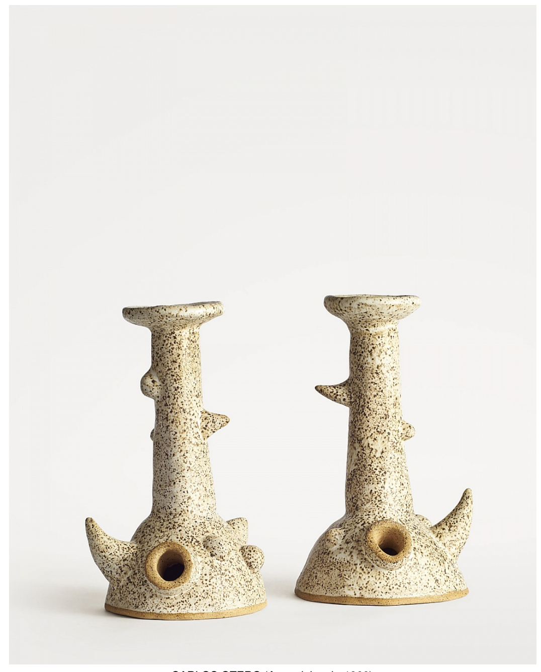
CARLOS OTERO (Argentinian, b. 1966) Untitled , 2016 Stoneware

Left: 8.25" H x 5" D base Right: 8" H x 5" D base