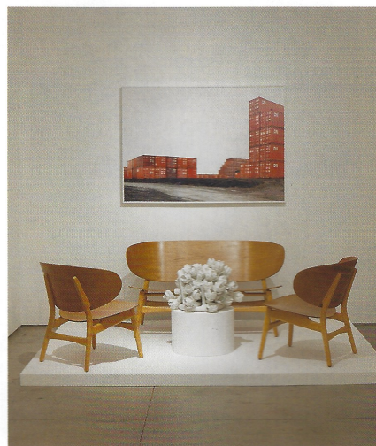
Design Destinations: Antique Shops in Greenwich Village Page 46