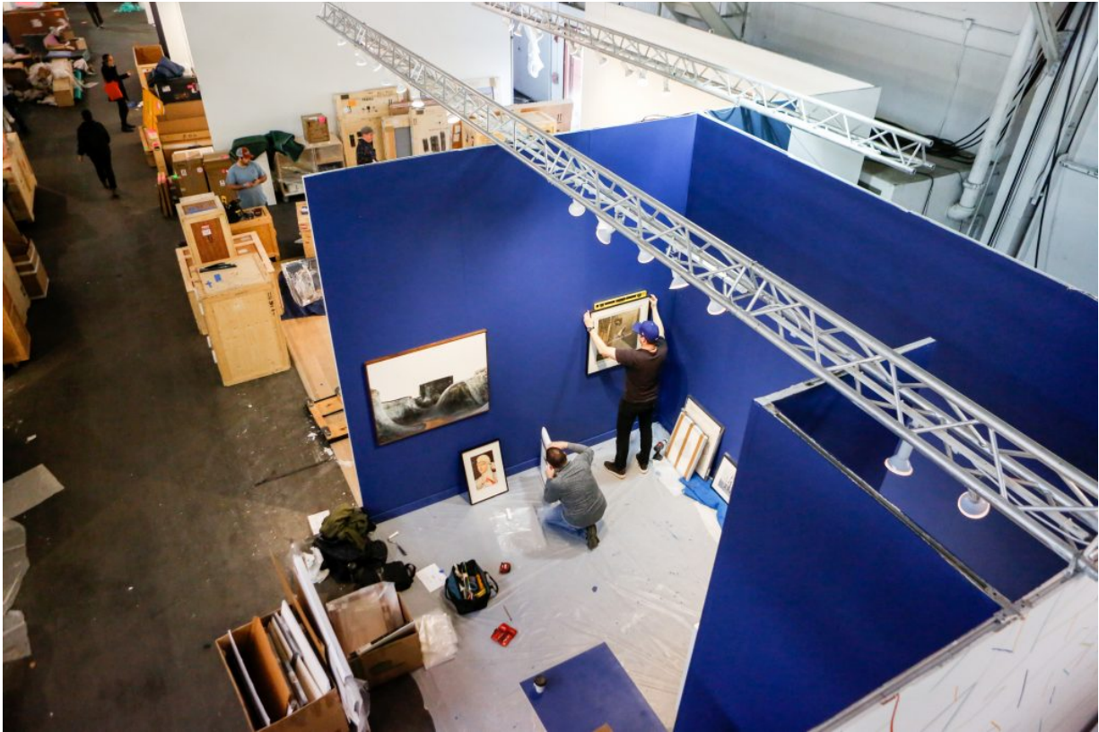
Gallerists and art handlers set up for the FOG Art + Design fair in the Levy Gorvy Gallery booth at Fort Mason on Jan. 15, 2019 in San Francisco.