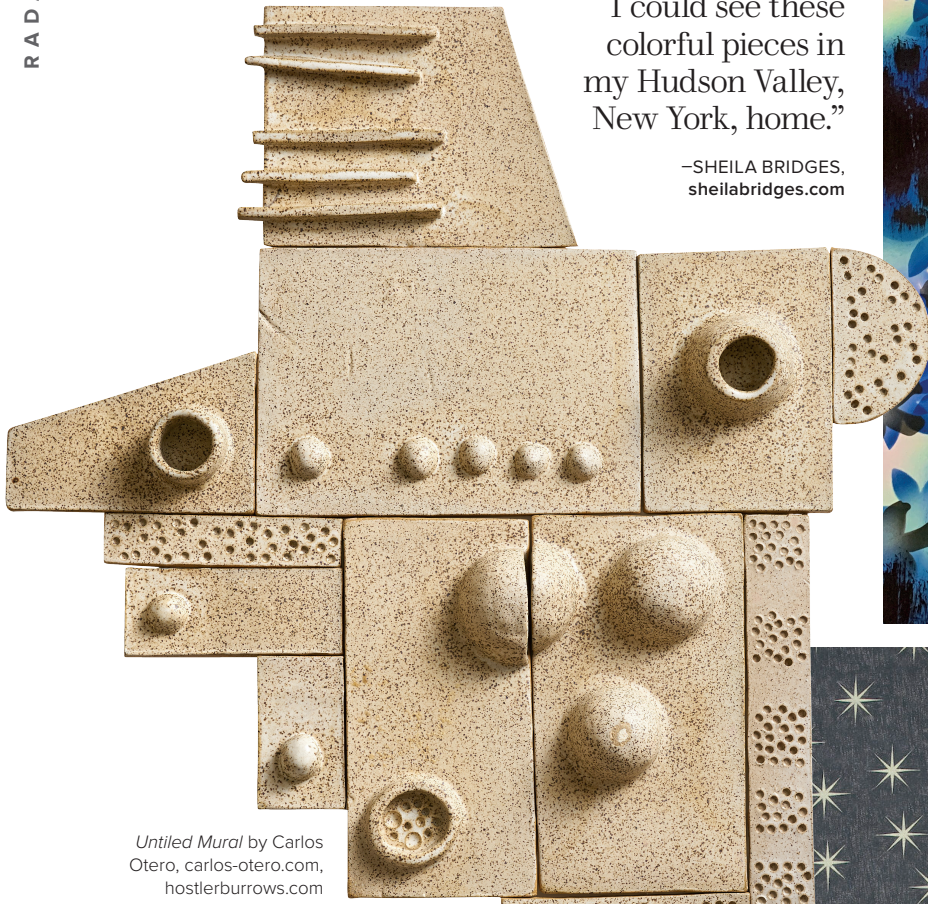
Untiled Mural by Carlos Otero, carlos-otero.com, hostlerburrows.com