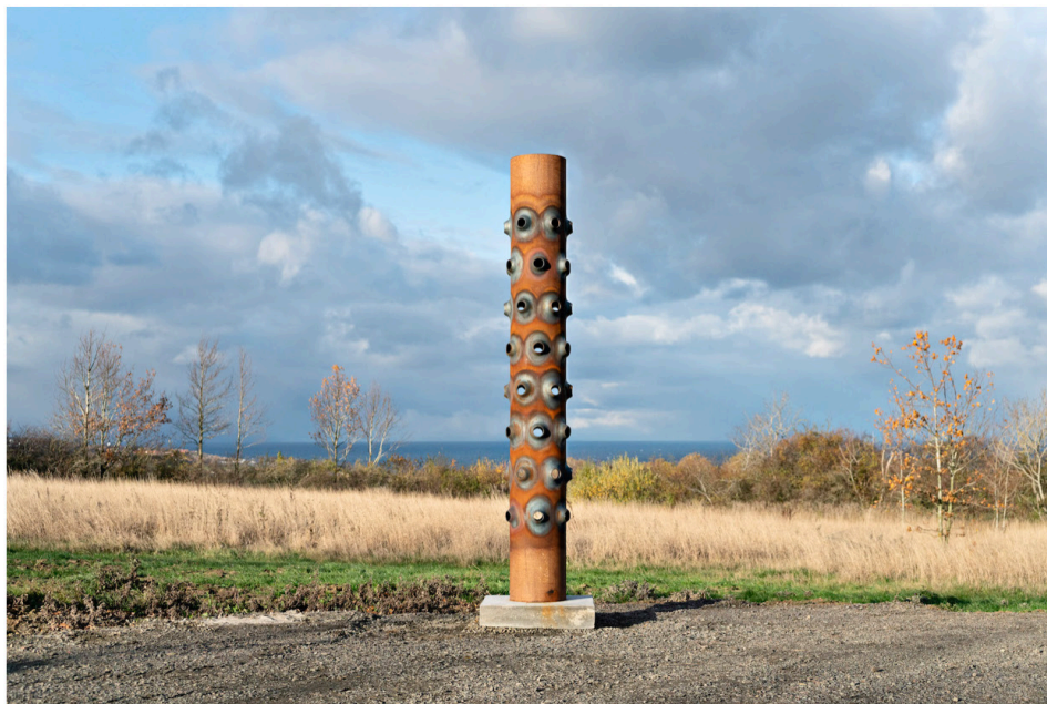
Sculpture by Jakob Jørgensen.

“When you start heating the material it totally loses control and form, where it was straight it starts to deform and crack... You either have to go with the material, or you will get lost in trying to make tools that can try to control it. In the beginning I had more control, but now because of the scale it is falling through my hands a little bit. At the same time the process is becoming a lot more interesting as the material becomes more alive and human in a way.”