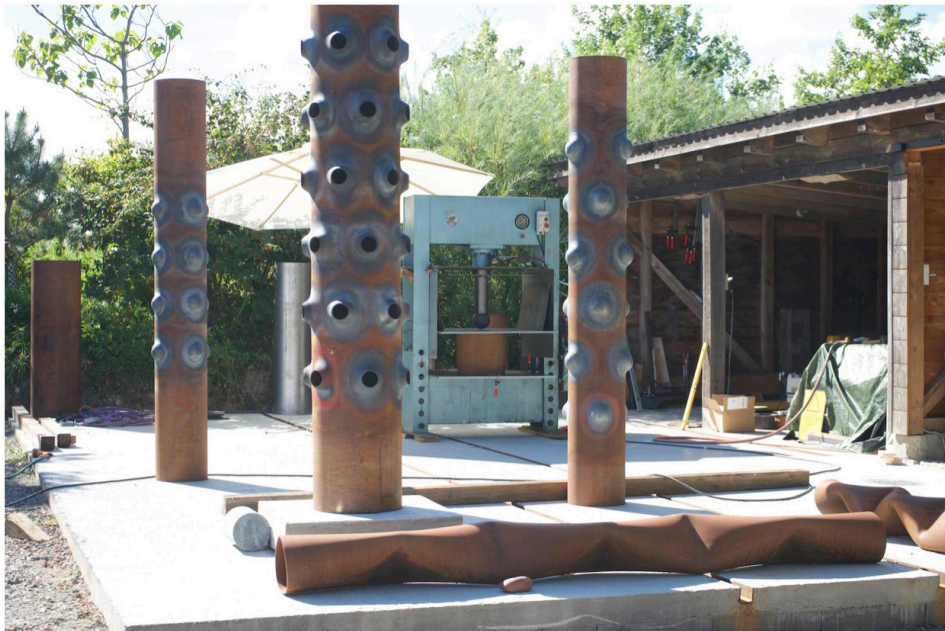
New sculptural work by Jakob Jørgensen.

The exhibition he mentions is Take Root at New York's HB381 Gallery – a new dedicated solo artist presentation space by Hostler Burrows . The exhibition opens 3 March 2023 and marks Jørgensen's most ambitious yet; gone are the functional remnants of his last solo show at Paris' Maria Wettergren Galerie in 2018 titled Totem – such as the monumental Faba bench. While Totem worked with smooth, blackened steel alongside details in wood, Take Root is more in touch with the rawness of the material and the elements, perhaps reflective of his move to Bornholm. The raw, cracked steel tubes used in this exhibition have been allowed to rust and decay naturally, and will continue to do so at differing rates depending on their final home. While jumping up in scale since 2018 has allowed further exploration into Jørgensen's methodical material interventions, it has also taught him to embrace the natural tendencies of the raw steel, as he explains;