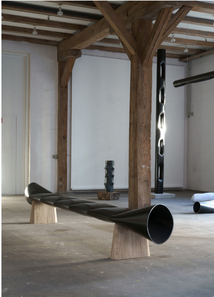
Faba bench by Jakob Jørgensen.

With his first solo exhibition within the United States just around the corner, Jakob Jørgensen's sculptural works have grown – both in scale and ambition. These latest works mark his individual practices transition from a design led studio to one that is exploring materiality and the purely sculptural. What remains from his first tubular steel piece back in 2017 through to this latest collection is Jørgensen's inquisitive nature towards his chosen medium – heating, pushing, expanding, compressing and deforming the humble steel tube in order to create new expressions.