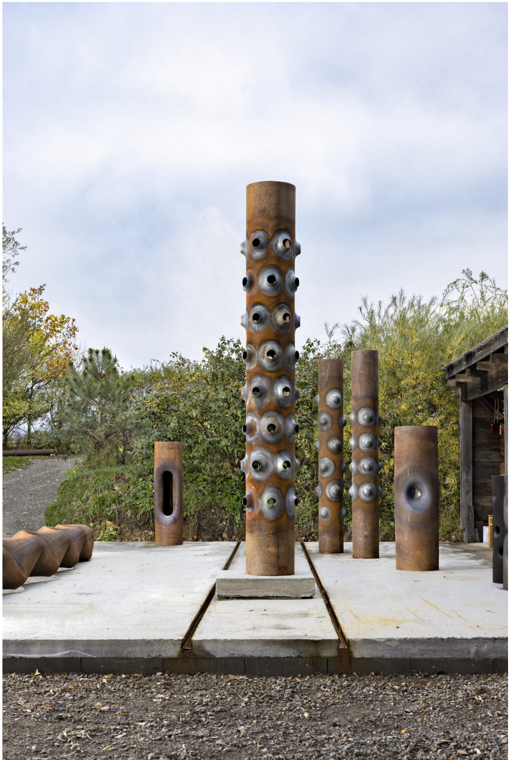
New sculptures by Jakob Jørgensen.