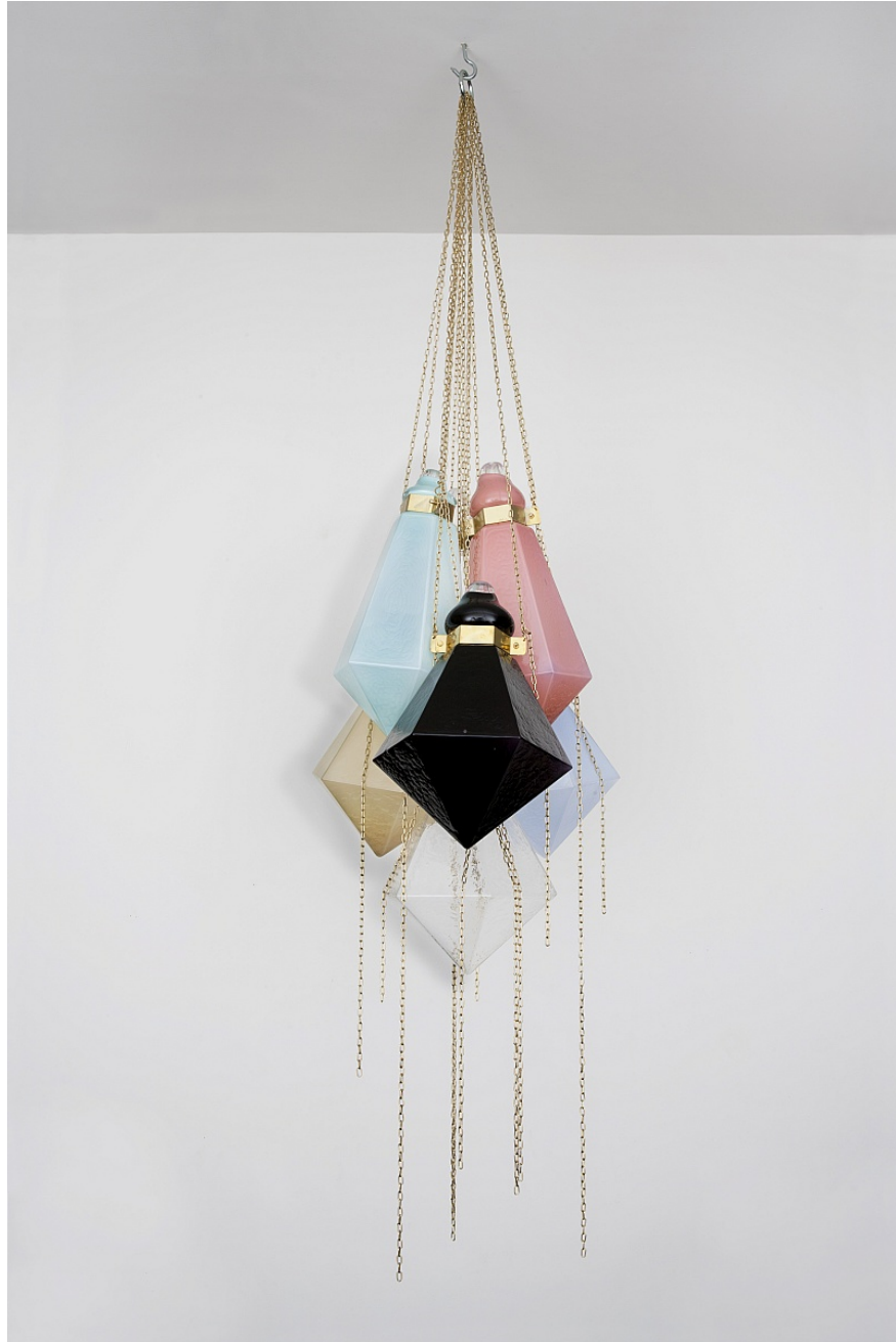
FRIDA FJELLMAN (Swedish, b.1971) Lustre aux Couleurs Arts Deco , 2016 Glass, brass 62" H x 24" W Unique