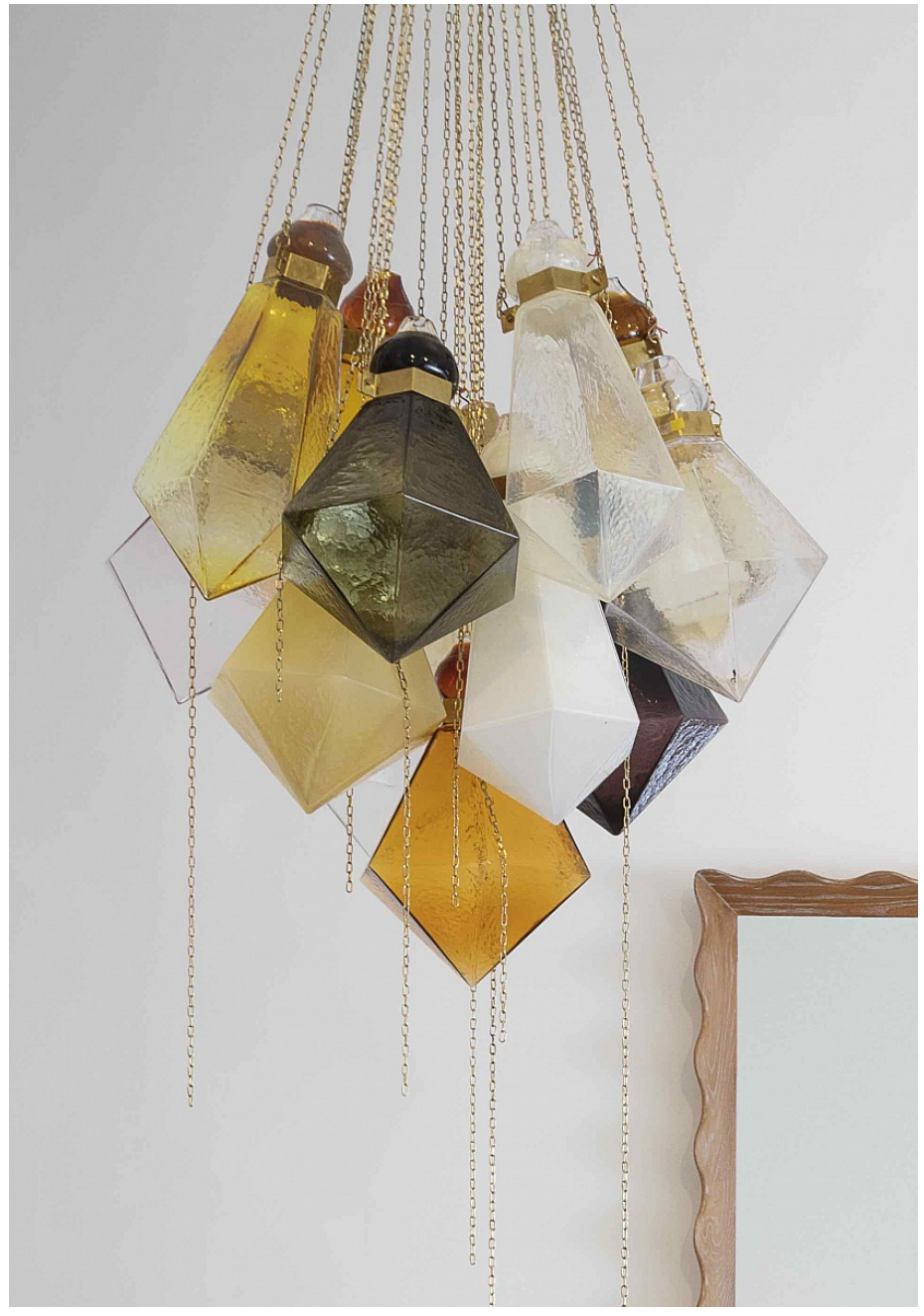
FRIDA FJELLMAN (Swedish, b.1971) Lustre En Cristal Topaze Enfumée, 2016 Glass, brass 77" H x 32" W Unique