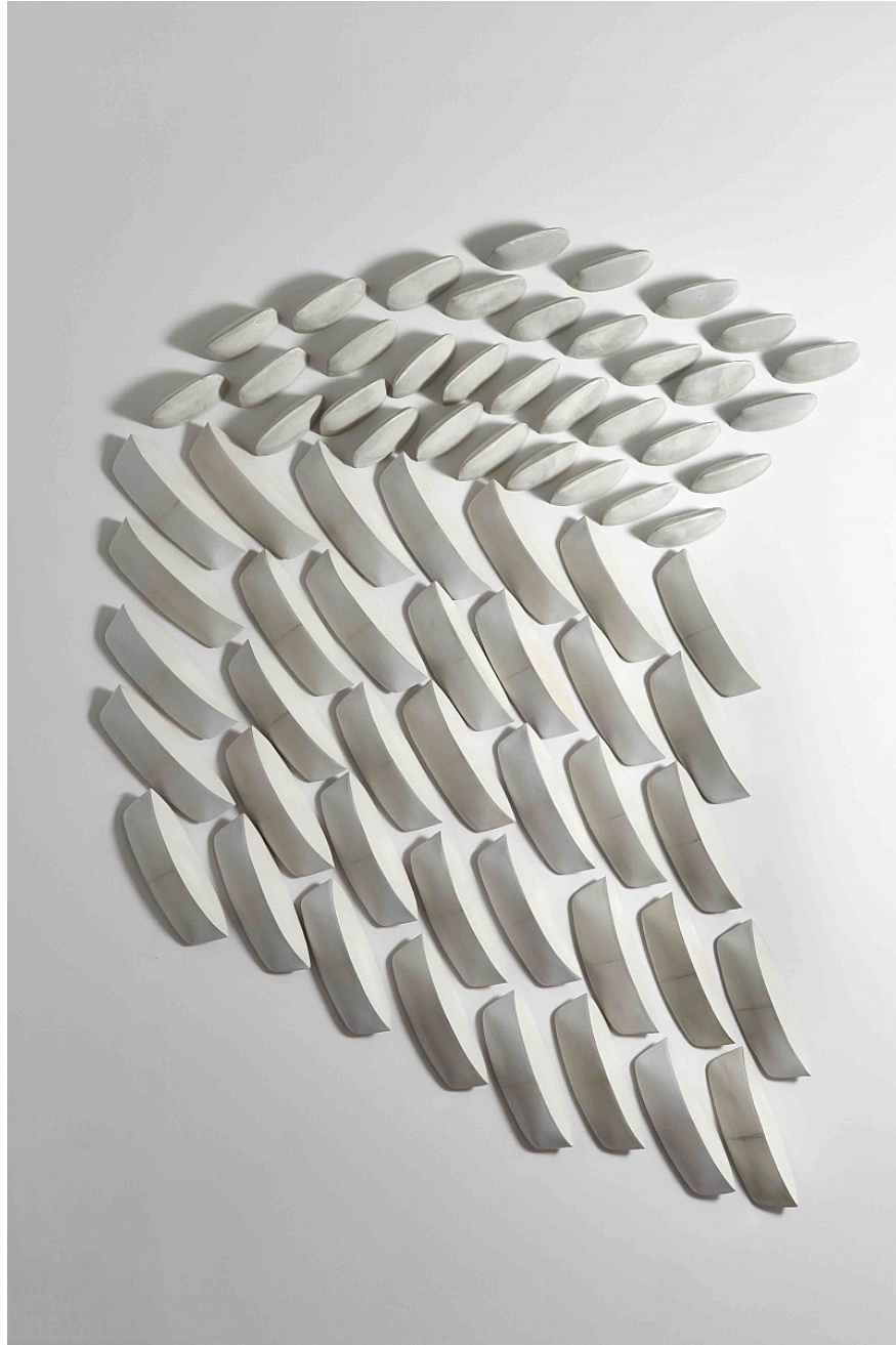
MAREN KLOPPMANN (German, b.1962) Convergence III , 2019 glazed porcelain, hand-built, 70 elements 83" H x 68" W x 3" D